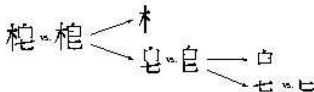
Figure 12-7. The Most Superior Node of an Ideographic Component

Suggestion figure S.2 be changed back to it's original form as in Unicode 5 , and the caption be changed to from "The Most Superior Node of an Ideographic Component" to "Comparing From The Most Superior Node"