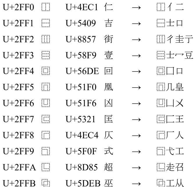
Figure 18-8. Examples of Ideographic Description Characters

For reference the figure 18-8 is repeated below: