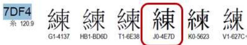
Figure 2 U+7DF4